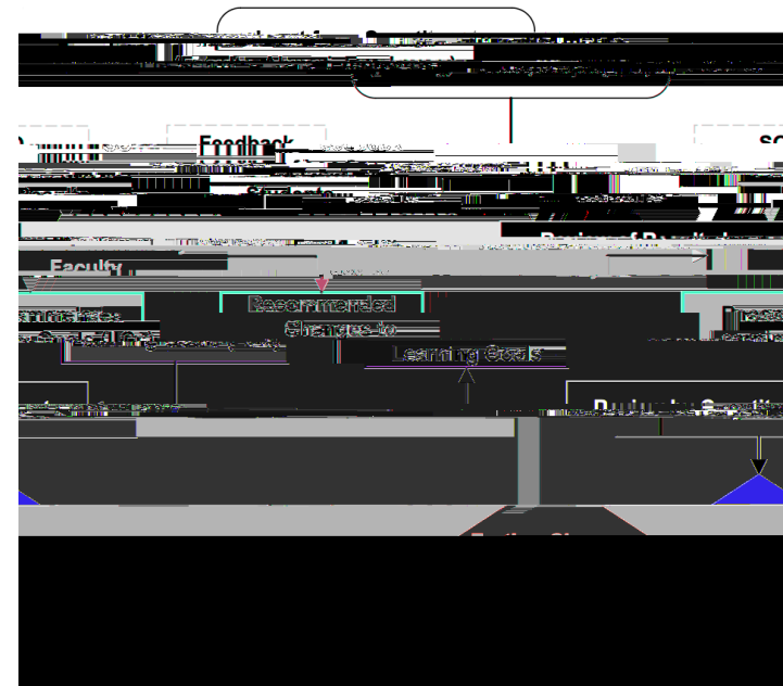
Fig. 2: Learning Goals Review